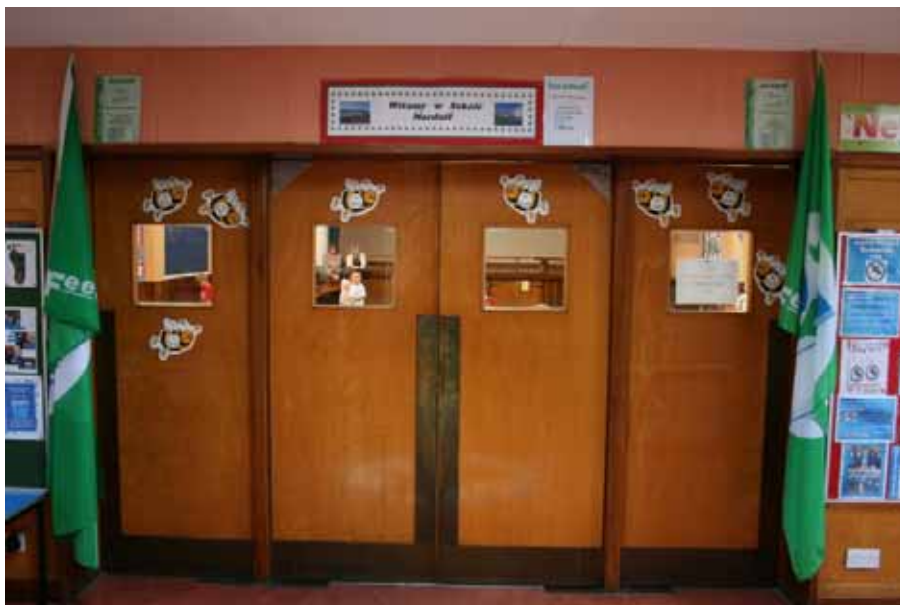
Green Flags on display at Macduff School

There is a cost involved for countries which sign up to Eco-Schools payable to the Federation for Environmental Education. This cost involves an annual fee and a levy for each school that registers. The total cost for Scotland was covered by the national office and was 7,500 Euros.