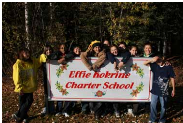
Year 7 students and their teacher

I left the school with a firm belief that Environmental Education can provide authentic learning experiences for all students, and is a particularly engaging vehicle for Indigenous Students. I can also see great value in connecting students in from Australia with students from different cultural backgrounds using the internet to enhance their understanding of the world as a whole.