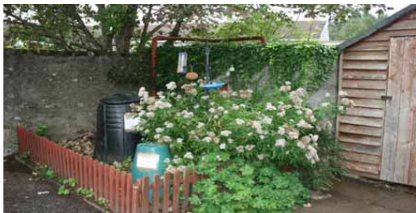
Nature corner at Durriss School

We feel good because we are doing all we can to make things better for the world.