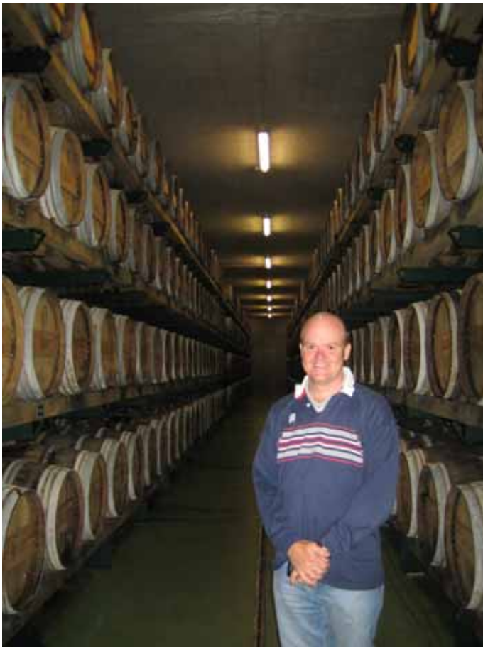
Image: Ultra modern vinegar barrel storage at Golles (Austria). Over 1000 barrels are stored full of vinegar at Golles.

None of these are earth shattering ideas, it just took someone to see the opportunities and invest in them.