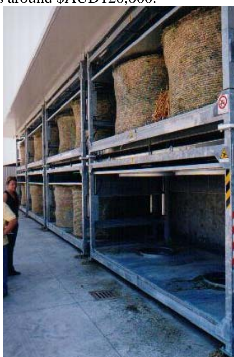
Quality hay production.....

The hay dryer is a simple piece of equipment – hot, dry air produced by a generator is pushed through flexible hoses to the top and bottom of a round bale of hay sitting on its flat end. The hay, which has been baled within 24 hours of cutting, is dried to around 85% (from its baling dry matter of ~35%) within 5 hours. This allows the farmer to have hay stored in the shed within 36 hours of cutting, posing a number of advantages – reduced lead shatter and loss of quality, ability to take advantage of short windows of good weather, faster regrowth, and an overall increase in hay quality. Cost to the farmer for 8 modules (allowing drying of 16 bales) was around $AUD120,000.