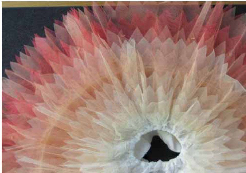
Figure 3: Underside of tutu skirt showing hoop.