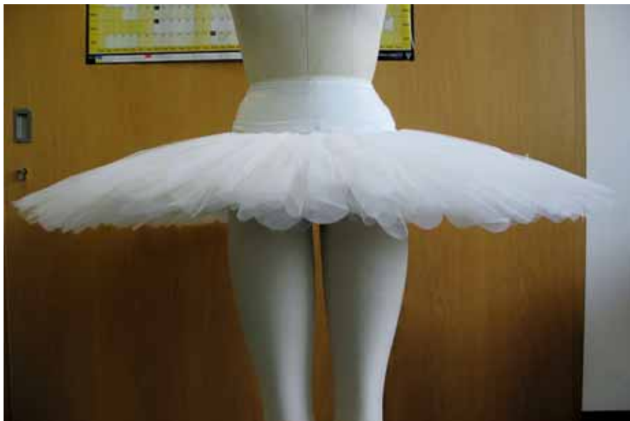
Figure 1 ; Short tutu skirt

The waistband will still need an extension on the left hand side at the centre back for the fastenings.