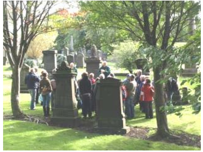
Glasgow Necropolis – Typical Tour Group

One of the most visited cemeteries in the world, Paris's Père Lachaise has to contend with a large number of fans heading to a small number of monuments namely; Jim Morrison of The Doors , Chopin, Oscar Wilde and Edith Piaf. Most fans do not need a map, the path is well worn. Armed security officers patrol around busy areas and the one overseeing the behaviour of visitors to the Morrison monument spoke good English and was happy to give information. French language general tours are available every Saturday and first and third Sundays, and selected week days. Special themed tours are held monthly. Most English-speaking visitors use maps which can be purchased by vendors outside the gates. English language tours are generally available on weekends and with private guides.