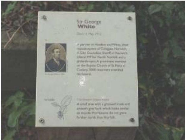
Norwich – The Rosary - Biographical and wildlife information

type of work Friends are able to carry out in cemeteries. Where headstones have been laid face-down, monumental inscriptions are not able to be collected or published.