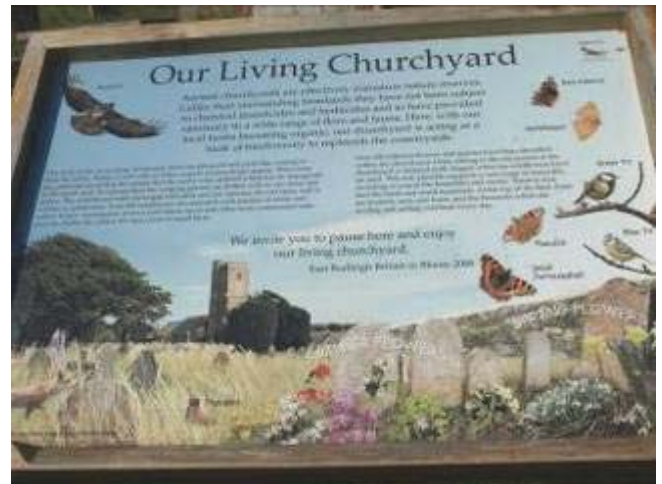
Devon – All Saints, East Budleigh