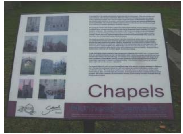
London – Nunhead – Thematic Sign