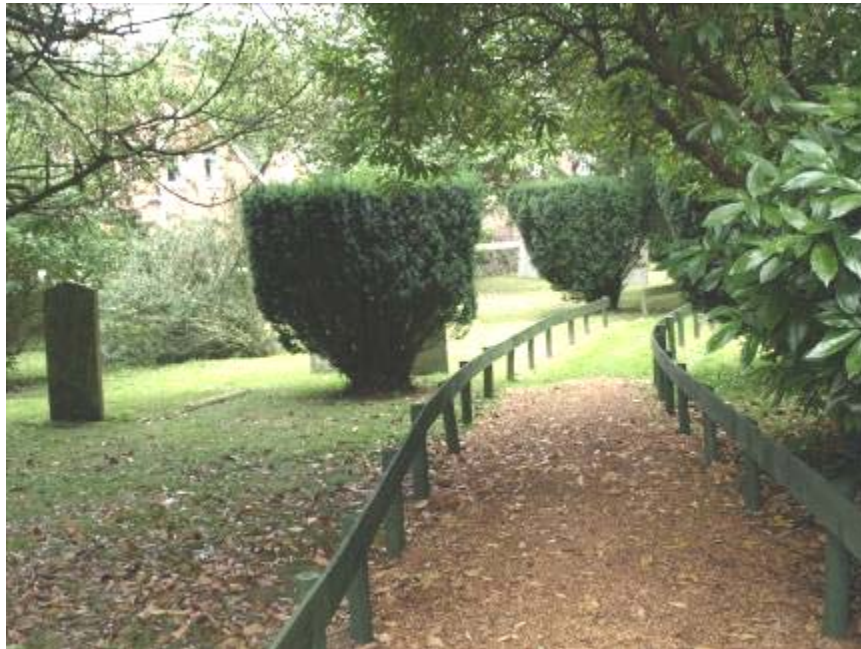
Tavistock – Dolvin Road A “wheely” friendly path

Access for disabled visitors and children in strollers in cemeteries can be extremely limited due to the roughness and/or steepness of the terrain. In order to improve visitor access, the Tavistock Town Council (Devon) has created paths in the Dolvin Road Cemetery to create a circuit allowing a good view of the monuments (at a safe distance).