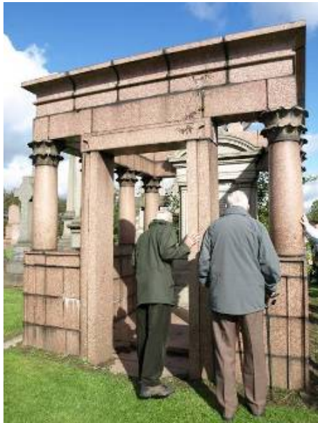
Who's there? Glasgow Necropolis

By encouraging the alternative use of facilities such as chapels to increase the number of legitimate visitors to the site, there is a resultant reduction of vandalism and graffiti. Burial grounds which appear neglected attract an undesirable element which discourages legitimate visitors.