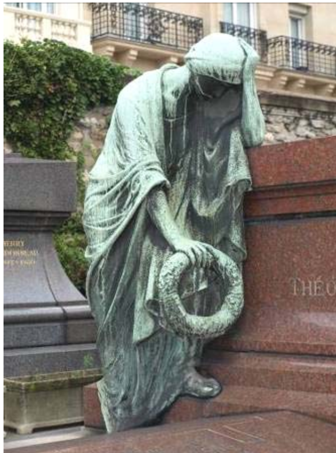
Montmartre – Paris Typical of the quality of bronze sculptures

I would like to the Secretary of the National Federation of Cemetery Friends (UK) who provided assistance in planning the trip. The Federation's website www.cemeteryfriends.org.uk was invaluable as it listed its' members' events so that the greatest use could be made of the time available. I am also grateful for all of those people who took time to show me around their home towns and welcomed me into their homes.