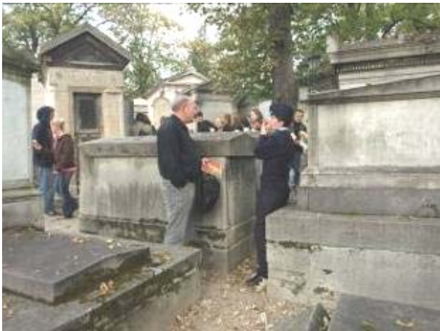
Père Lachaise – near Jim Morrison's grave

One of the most visited cemeteries in the world, Paris's Père Lachaise has to contend with a large number of fans heading to a small number of monuments namely; Jim Morrison of The Doors , Chopin, Oscar Wilde and Edith Piaf. Most fans do not need a map, the path is well worn. Armed security officers patrol around busy areas and the one overseeing the behaviour of visitors to the Morrison monument spoke good English and was happy to give information. French language general tours are available every Saturday and first and third Sundays, and selected week days. Special themed tours are held monthly. Most English-speaking visitors use maps which can be purchased by vendors outside the gates. English language tours are generally available on weekends and with private guides.