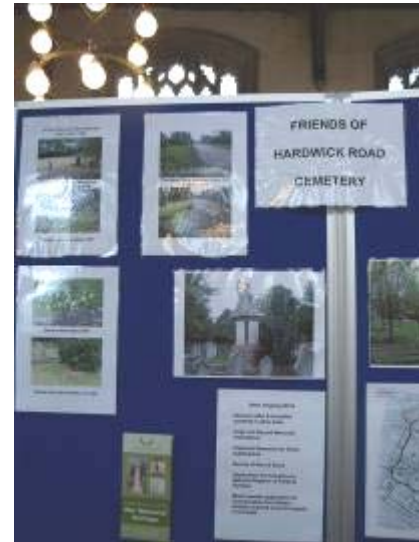
Hardwick Road - East Anglia Building Conservation Fair