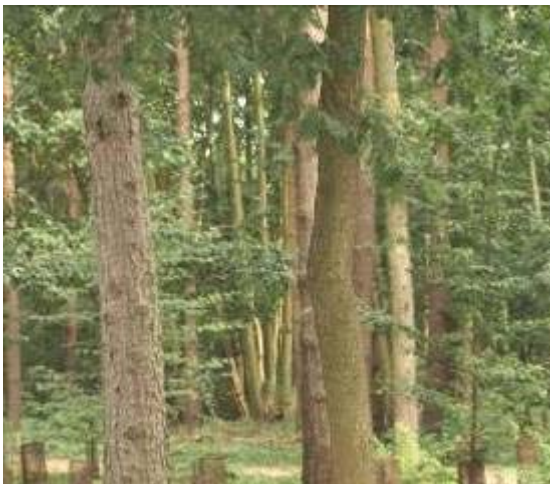
Colney Wood Burial Park

Other cemeteries and churchyards have set aside a portion of land, generally without monuments, as nature reserves. The Friends of Hardwick Road are replanting indigenous plants to provide a buffer zone and wildlife corridor.