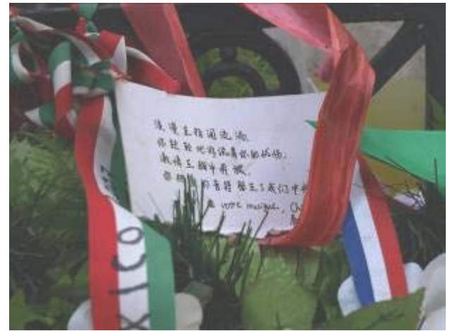
International visitors at Chopin's grave