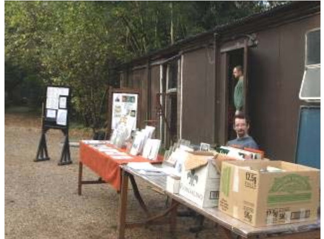
Nunhead, London – Welcoming visitors