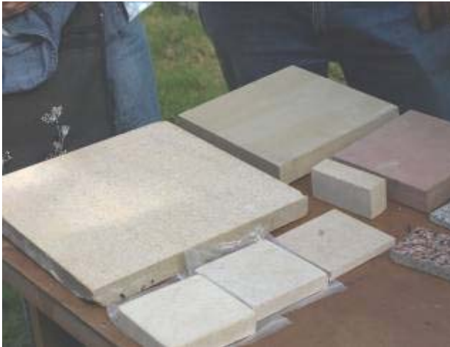
Hardwick Road – Learning about stones

tours supplementing the ones conducted by the Glasgow Necropolis Rangers. Each tour was conducted by a different guide, who brought their own expertise to the commentary. Each tour lasted well over an hour and was very comprehensive including not only biographical information, but information about funerary symbolism, ornamental plantings and Scottish History. As the cemetery is dominated by a huge statue of John Knox on a column, the history lesson was a given.