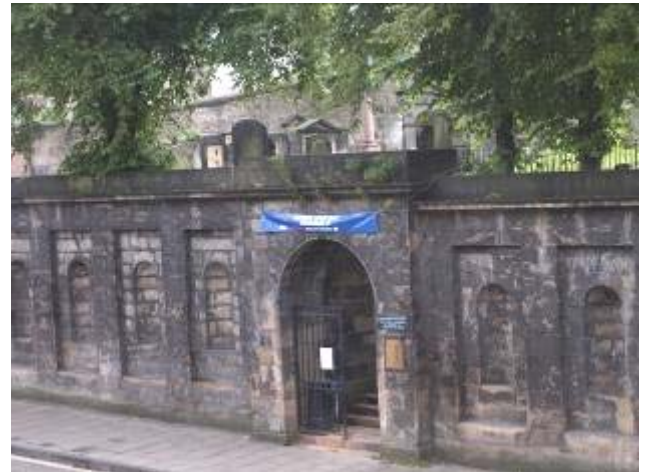
Edinburgh – Open Doors Day 29 Sep 07