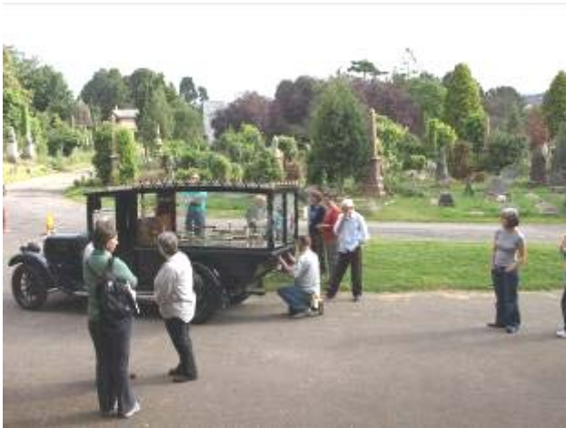
Arnos Vale – Open Doors Day 8 Sep 07

many years, neglected and left to become overgrown with brambles and stinging nettles. The Friends surveyed the visitors to the Open Day to ask them what sort of tours and programs they are interested in. The Friends of Arnos Vale works closely with the Arnos Vale Cemetery Trust which was created to run the cemetery when it reverted to public ownership. The Trust recently obtained a £4 million plus Lottery Grant which will be used to restore the Anglican and Non-Conformist Chapels, the East Lodge and employ an education officer commencing in November 2007. The East Lodge will be used as a family history research centre while the chapel will be used for educational purposes.