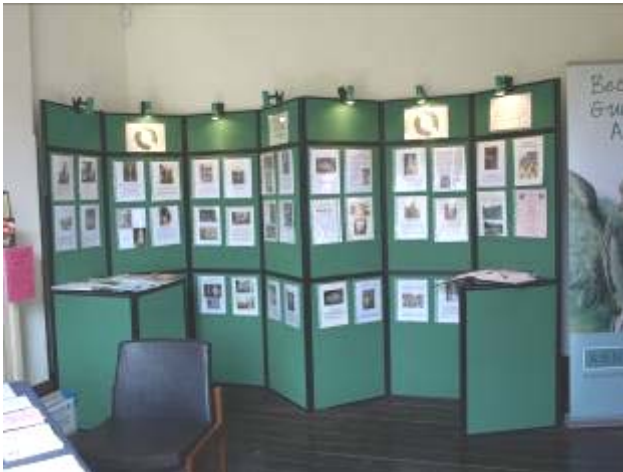
Arnos Vale – Open Doors Day

Where venues are available, cemetery groups utilise static display boards. The Friends of Hardwick Road had a display at the East Anglia Building Conservation Fair in order attract new members. Friends of Glasgow Necropolis used small mobile boards which they pulled out when conducting their tours. The already restored West Lodge at Arnos Vale features display boards donated to the Friends. Local history study centres in local libraries were the most receptive to displaying and distributing cemetery materials.