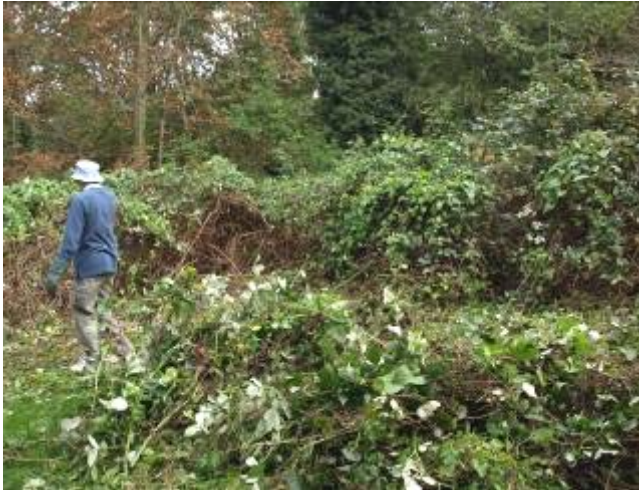
Nunhead, London – Working Bee